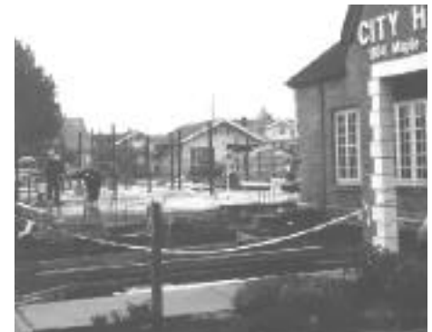
The expansion is to the east of the current City Hall into a former City parking lot.