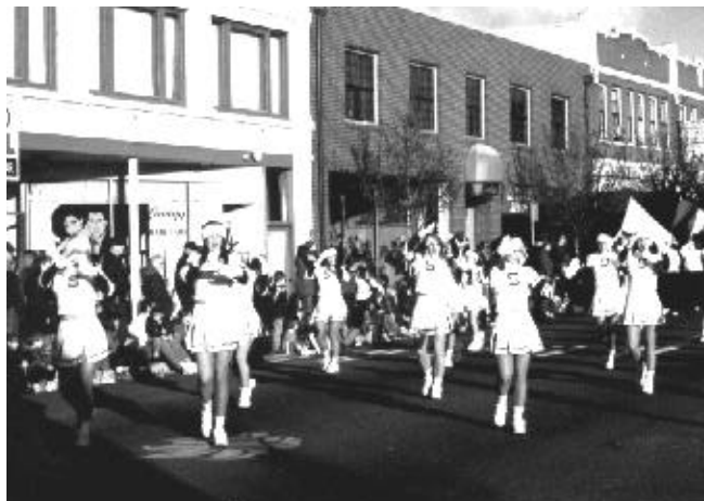
Sumner's downtown celebrated the holiday season with its annual Santa parade held Dec. 2. A large crowd turned out under sunny skies for the parade that included the Sumner High School band and drill team, left, and Santa riding on a Sumner ladder truck, below. The Stuck River bridge was lighted for the holidays, below.