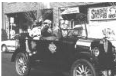
A classic car rolls down Main Street in a past St. Patrick's Day parade.

Please join us for the 4th Annual St. Patrick's parade on Sun., March 14 at 1 p.m. The parade will start at Heritage Park, continue down Main St. and finish at the high school.