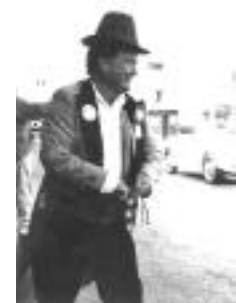
St. Patrick's Day parade