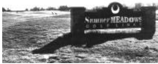
Sumner Meadows will remain a golf course.

The City Council has decided to keep the Sumner Meadows Golf Course. After reviewing the course performance and operations, along with alternatives to sell the property for development, the Council has elected to keep the course. The course has struggled since opening in 1995 because of the slow economy, construction on Stewart Road, and a decline of golfing nationwide.