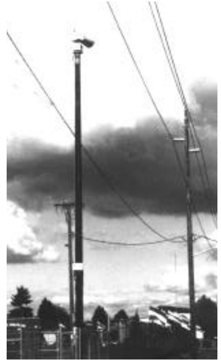
The siren is next to the high school football stadium

For further details, please contact Robyn DeLorm at (253) 863-8136.