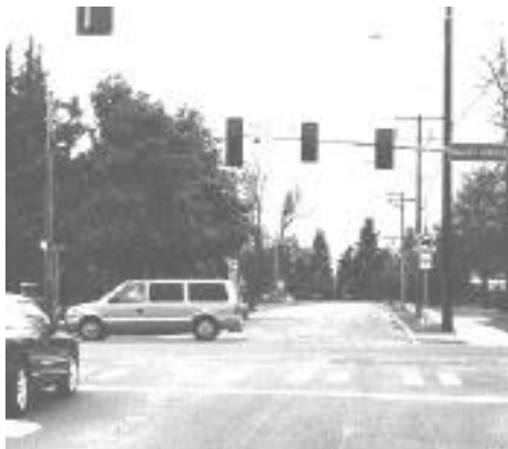
The new light is welcome by residents along Meade McCumber Street east of Valley Avenue.

A new four-way traffic signal was activated in February at the intersection of Valley Avenue and Meade McCumber Street. The new signal, which cost the City $125,000, had been requested by area residents particularly in the neighborhood east of Valley along Meade McCumber. Children from those areas have to cross Valley Avenue to get to Sumner Junior High and Maple Lawn Elementary. Motorists also had difficulty turning south on Valley Avenue from Meade McCumber during peak traffic periods. Traffic volume on Meade McCumber is increasing because of the new housing developments in that portion of the city. Also, motorists are finding Meade McCumber a convenient route to the Sumner Senior Center and the QFC Shopping Center.