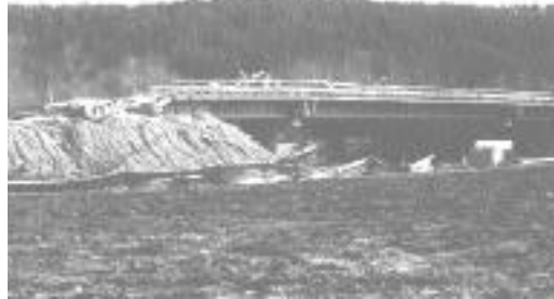
The new bridge across the Stuck River is nearing completion. The bridge connects Tacoma Avenue south of the river with an extension of 142nd Avenue, north of the river, which is currently being widened. The state plans to build a SR 167 freeway interchange at 24th Avenue.

Since 1994, the City has been working with property owners and businesses to build new roads and utility facilities. A major sewer line to provide service to the City's north-end (north of the White River) was completed two years ago. A two-million gallon water reservoir to provide increased fire-flow will be completed this spring. Construction on a road and bridge will be completed this summer, and work on the new freeway interchange is planned to start next fall. All of these projects are funded with a combination of fees on new utility users, local improvement districts, State Department of Transport money, and grants.