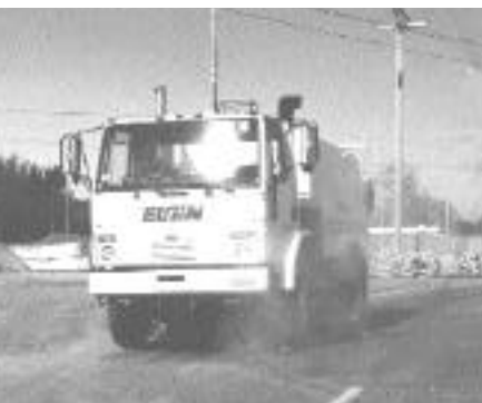
The new vehicle is a regenerative air crosswind sweeper.

The City of Sumner has purchased a new street sweeper that replaces an older sweeper. The new Elgin sweeper, which cost $125,000, is different from the old brush sweepers. It sucks in dirt and debris like a giant vacuum cleaner and deposits the material into a large hopper. Street sweeping is important to removing street debris and protecting water quality in streams and rivers.