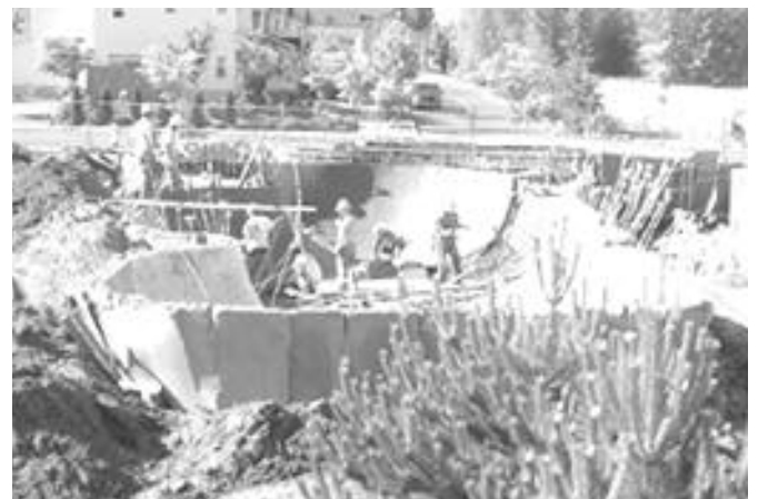
The bowls and bumps at the new Skate Park are taking shape with opening planned for later this summer.

A grand opening and dedication is planned for later. Watch the newspaper and City web site ( www.ci.sumner.wa.us ) for details.