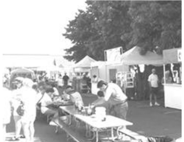
The Arts Festival features food booths, entertainment and more than 100 artists' booths.

Great food, fun, and entertainment! The 28th Annual Summer Arts Festival will be on August 3 & 4. There will be nearly 130 artists' booths downtown. Your favorite food vendors will be on hand with some additional new food booths to check out.