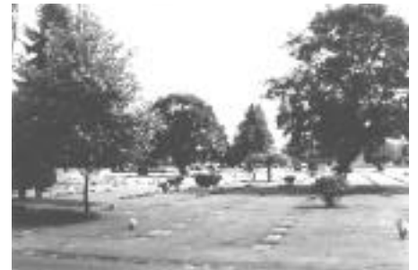
The south section of the cemetery has 27 acres available for expansion.

For more information about the Sumner Cemetery, call Cemetery Clerk Darlene Hull at 863-6345.