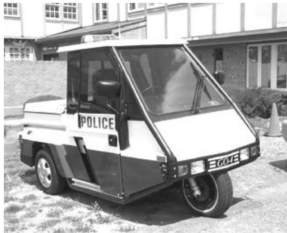
Sumner Police Department's new Parking Enforcement Officer will patrol in this new three-wheeled vehicle.

He'll be concentrating mainly on areas with time restrictions on parking, such as downtown streets as well as residential areas near the high school, Daffodil Sports Complex and train depot.