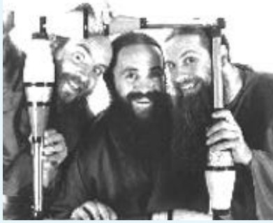
Mud Bay Jugglers perform July 27.