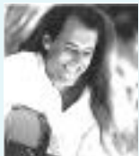
"Music Off Main" Concert Summer Series