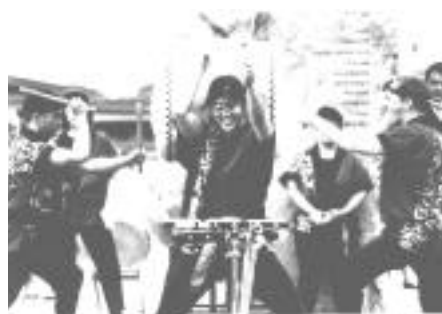
Portland Taiko Ensemble, July 16

Beginning Friday, July 16, Sumner will be holding outdoor musical events in Heritage Park every Friday starting at 6 p.m. Heritage Park is located at the corners of Main, Cherry and Kincaid Streets. Bring your dinner, a blanket, and family to enjoy the free hour of entertainment. The series is sponsored jointly by the City of Sumner and Sumner Promotions. The series of six concerts celebrates culture and diversity featuring various West Coast artists in an array of musical styles. In January, an artist selection committee formed of business and civic leaders, chose six ensembles from numerous performing artists.