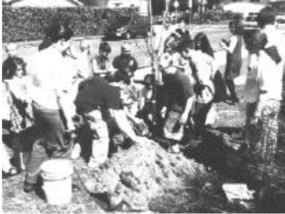
Students at Maple Lawn Elementary plant a Maple Tree at their school.

Students from Sumner High School's Earth Savers Club organized this year's Arbor Day. They worked with the leadership classes from Maple Lawn and McAlder Elementary schools to plant a maple tree at their school. The High School Earth Savers purchased the trees, arranged for the planting, and educated the younger students on the importance of trees. This was Sumner's 5th annual Arbor Day celebration. The State Department of Natural Resources recognized Sumner for its designation as a Tree City by the National Arbor Day Foundation.