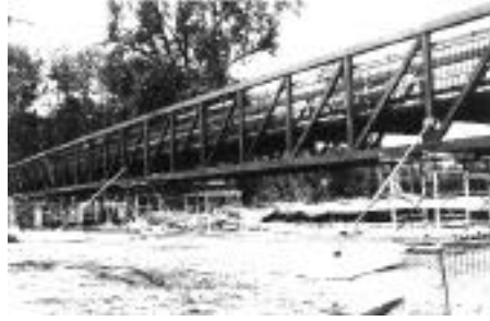
This pedestrian bridge will cross the Stuck River at 24th Street East. (extended).

The City will be constructing hand-capped-accessible wheelchair ramps on sidewalks at various intersections around downtown. New sidewalks