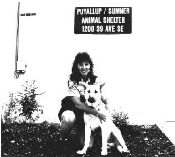
Pets such as this 8-month-old German Shepherd are available for adoption.

The shelter, located at 1200 39th Ave. SE on Puyallup's South Hill near Pierce College, is open Tuesday - Friday, 3 - 7 p.m. and Saturday, 10 a.m. - 4 p.m. The shelter is run by the City of Sumner which provides animal control services for both Puyallup and Sumner. In exchange, Sumner is provided use of Puyallup's city jail.