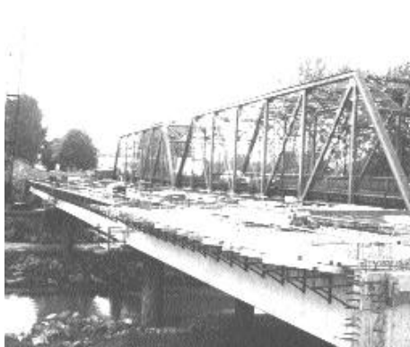
The existing two-lane steel structure is being replaced by a concrete span.