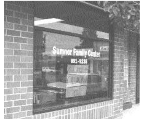
Sumner Family Center is at 918 Alder St. in downtown Sumner.