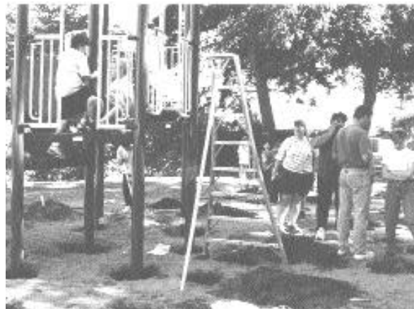
Some of the kids helped dig holes for the new playground equipment, left, while others played on the big toy just after it was installed.