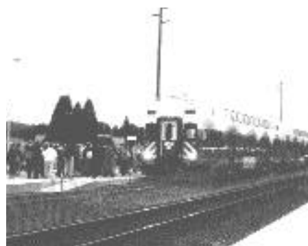
The Sounder commuter train pulls in to Sumner on its inaugural run Sept. 18.

The Sumner depot, when completed later this year, will have 600 feet of platforms on both sides of the tracks (currently platforms are 200 feet) and three large canopies for weather pro-