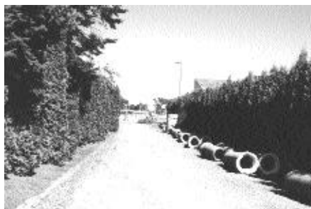
This access road to the Fire Station will become Station Lane.

Construction is underway on a new street - "Station Lane" - that will link the Sound Transit train station to Thompson Street and provide a direct access to State Route 410. The new arterial is designed to remove train station traffic from the adjacent neighborhoods and downtown. Vehicles will have quick and easy access routes from SR 410 and the train station on Thompson Street, which crosses under the train tracks and is not affected by passing trains.