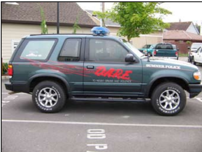
Freshly decaled and dressed with new tires, this Ford Explorer's ready to roll!