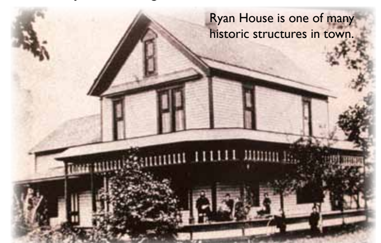
Ryan House is one of many historic structures in town.